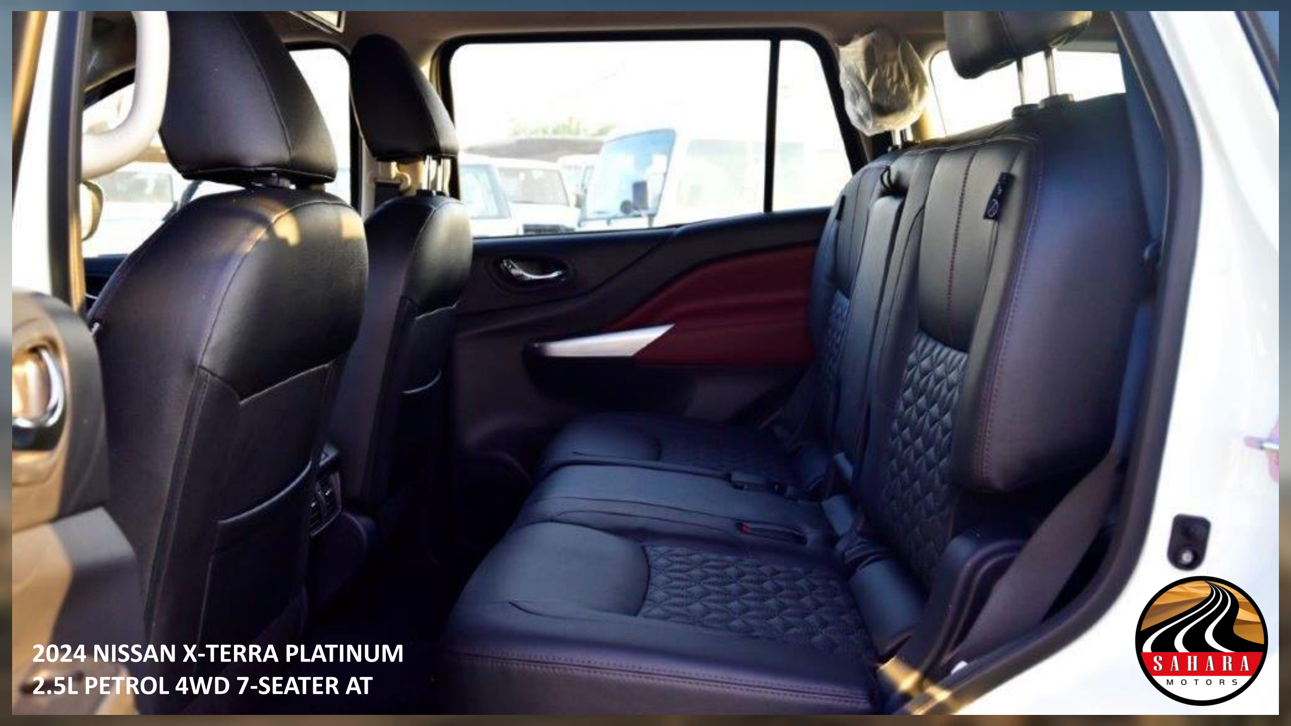
2024 NISSAN X-TERRA PLATINUM 2.5L PETROL 4WD 7-SEATER AT