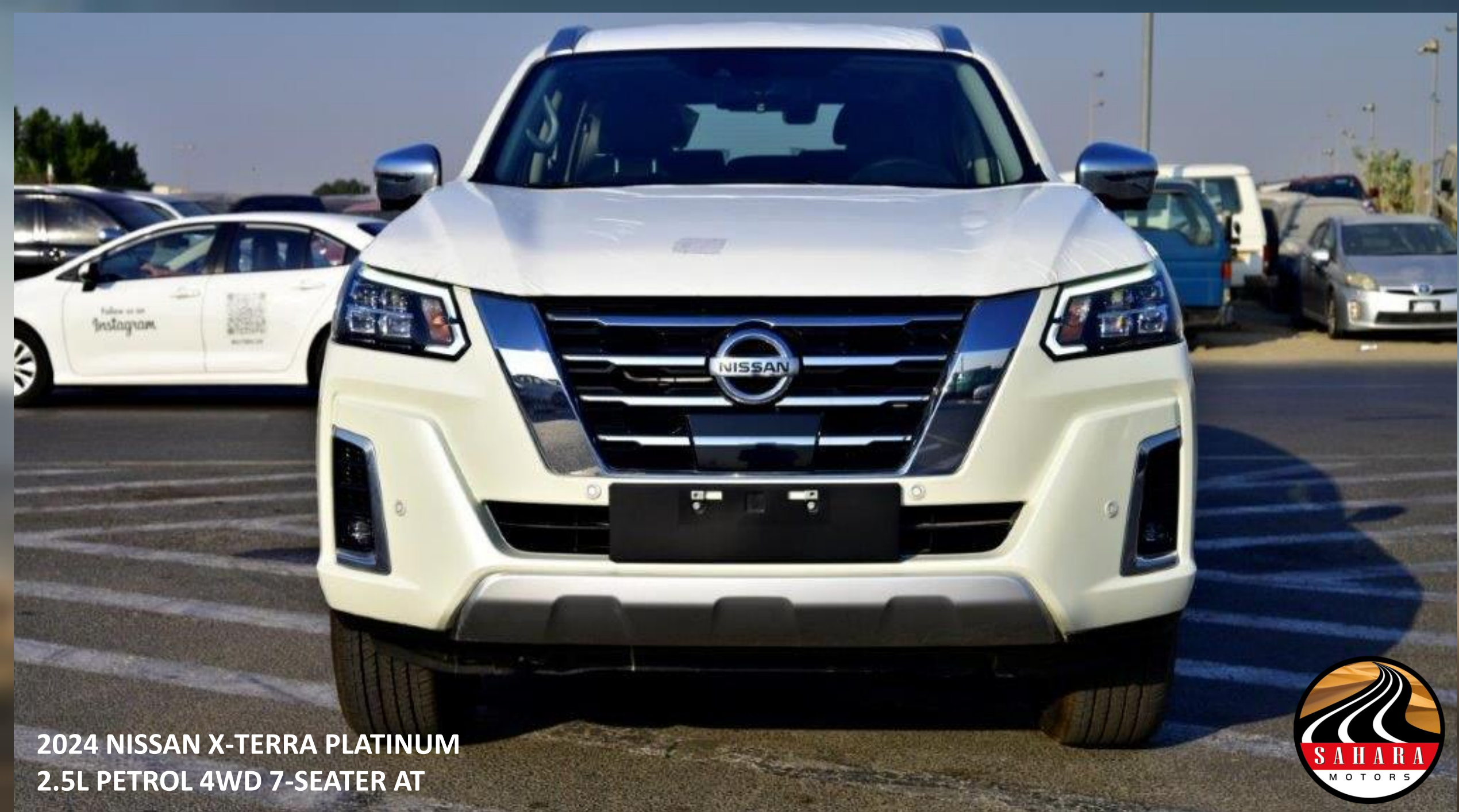
2024 NISSAN X-TERRA PLATINUM 2.5L PETROL 4WD 7-SEATER AT