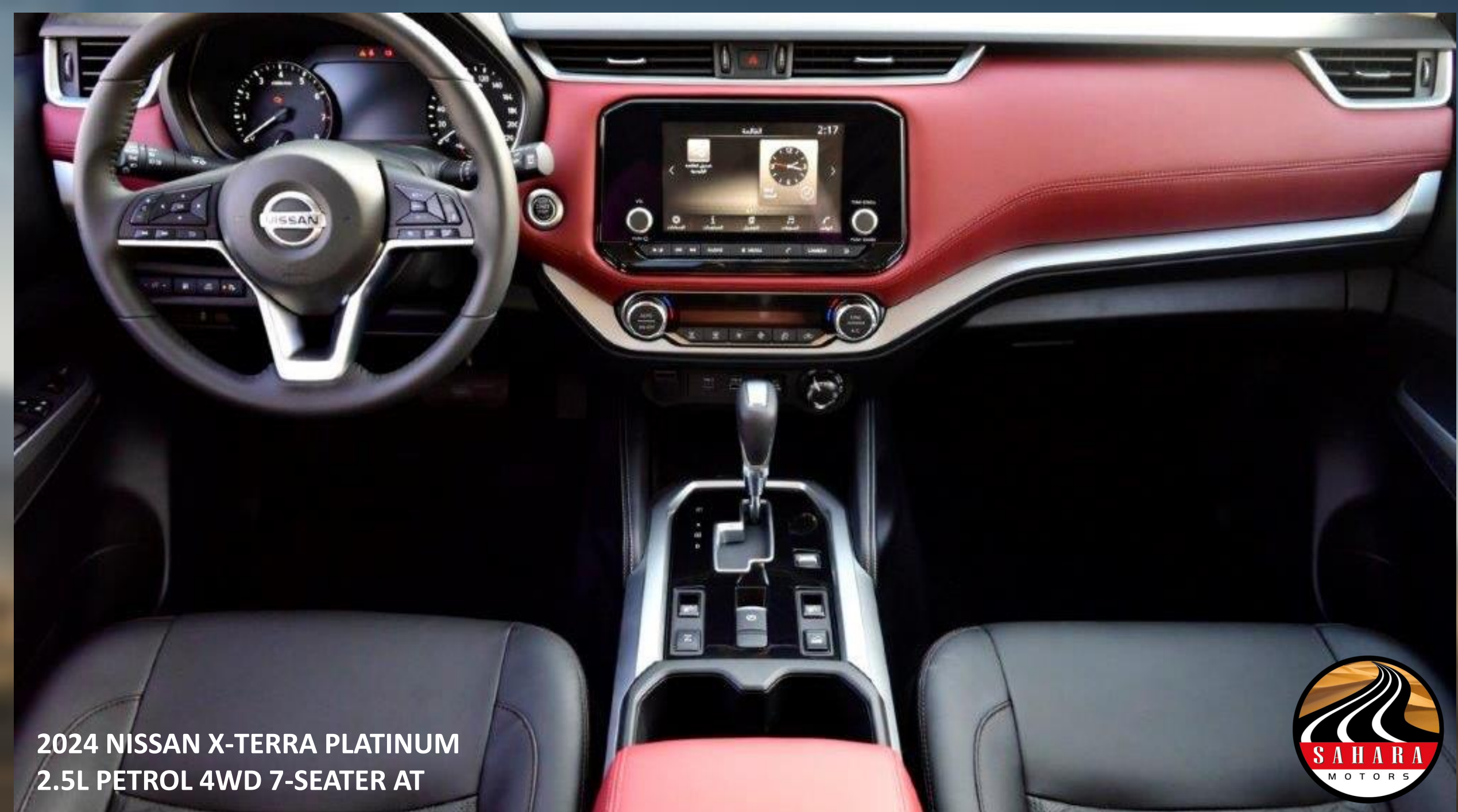
2024 NISSAN X-TERRA PLATINUM 2.5L PETROL 4WD 7-SEATER AT