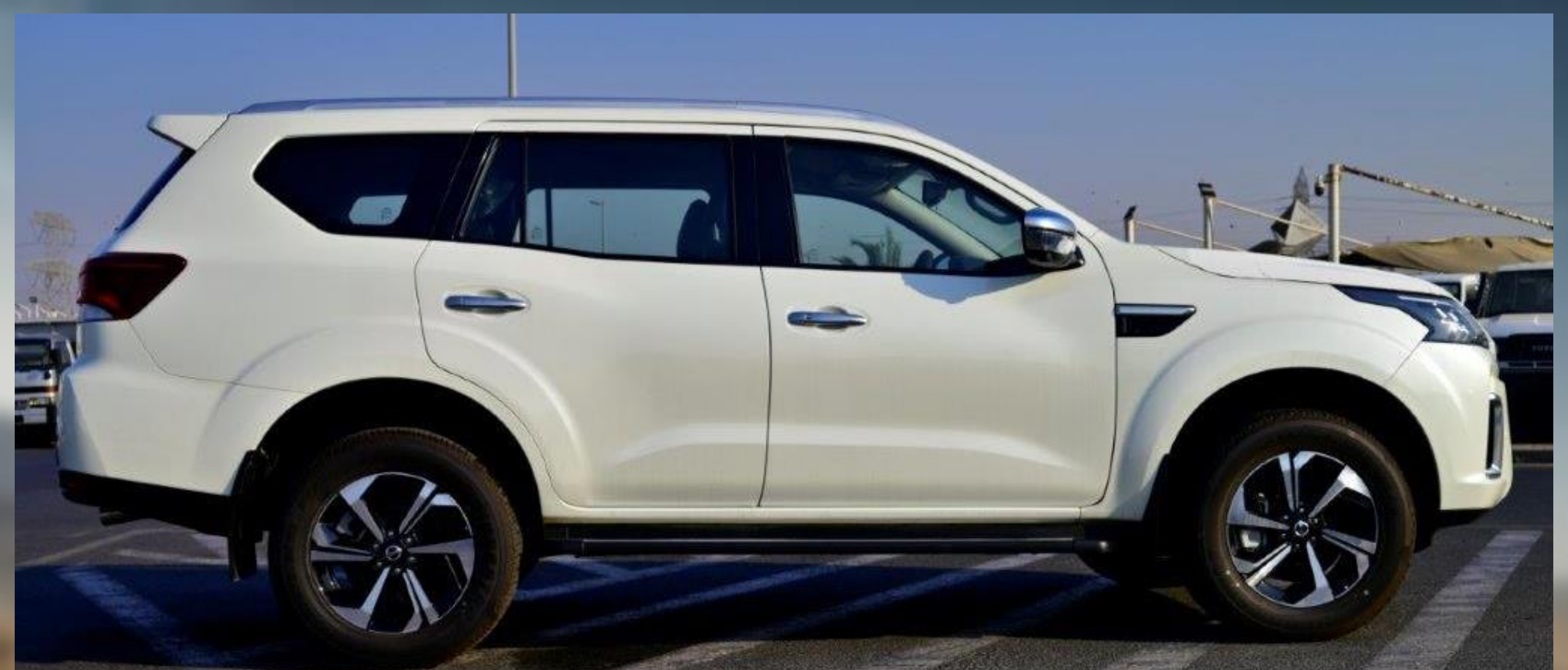
2024 NISSAN X-TERRA PLATINUM 2.5L PETROL 4WD 7-SEATER AT