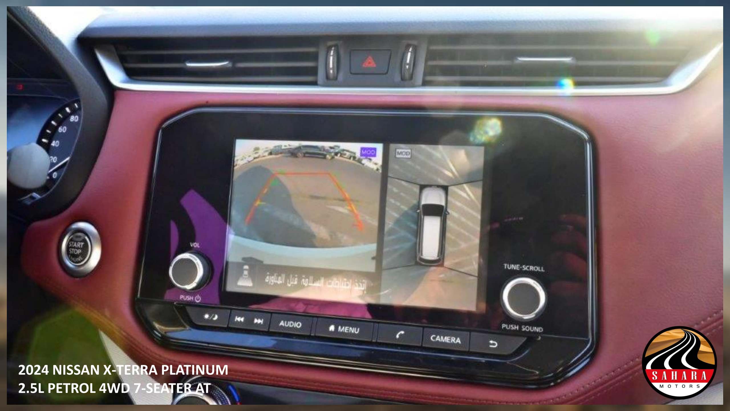
2024 NISSAN X-TERRA PLATINUM 2.5L PETROL 4WD 7-SEATER AT