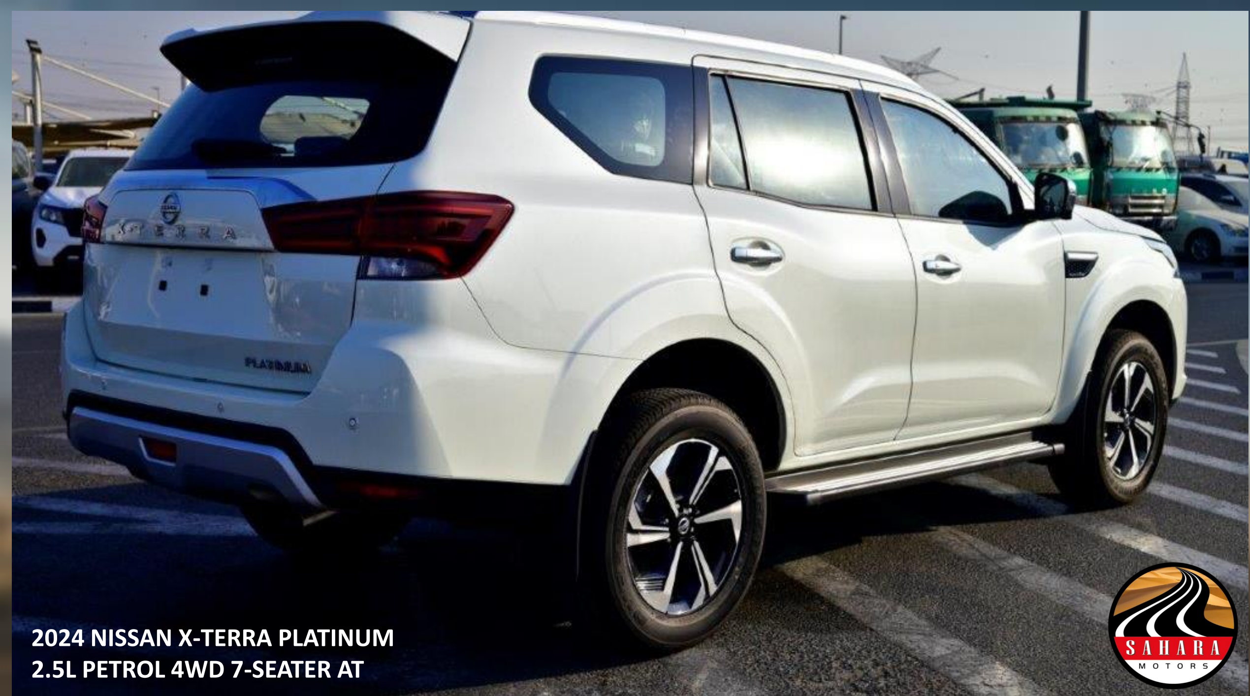
2024 NISSAN X-TERRA PLATINUM 2.5L PETROL 4WD 7-SEATER AT