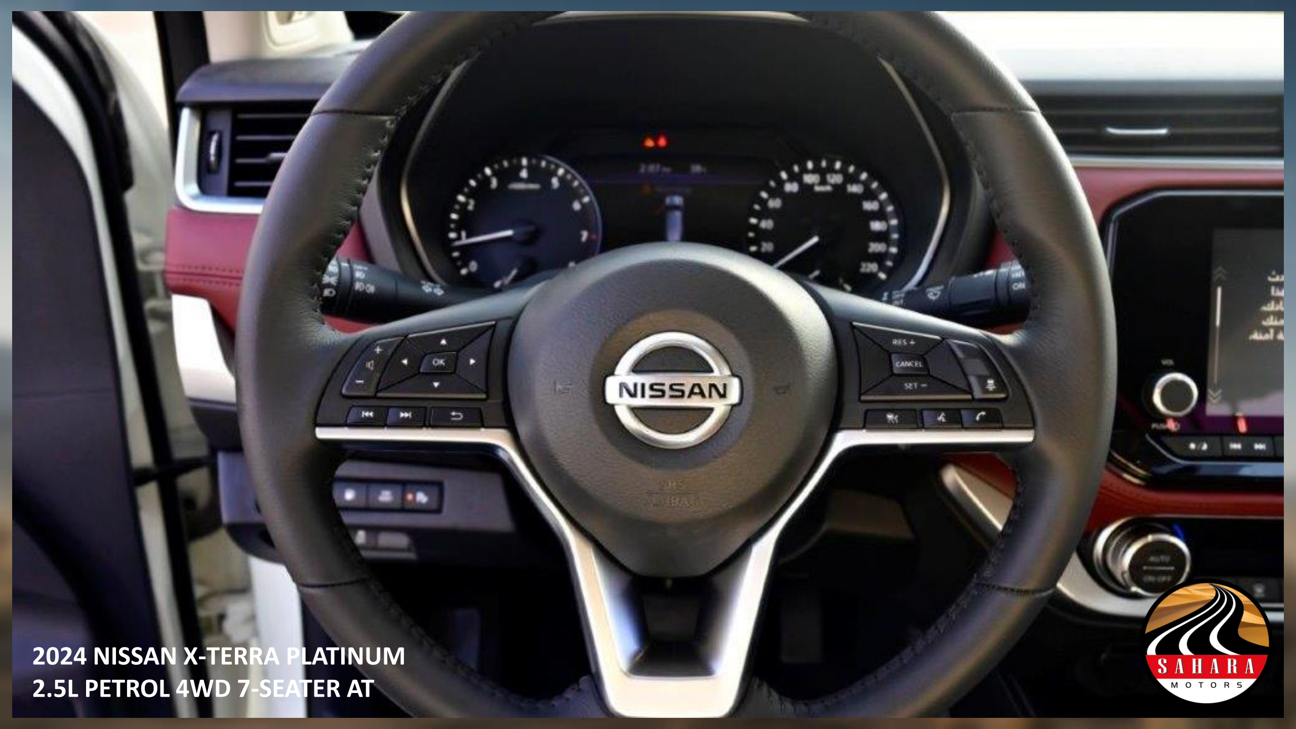
2024 NISSAN X-TERRA PLATINUM 2.5L PETROL 4WD 7-SEATER AT