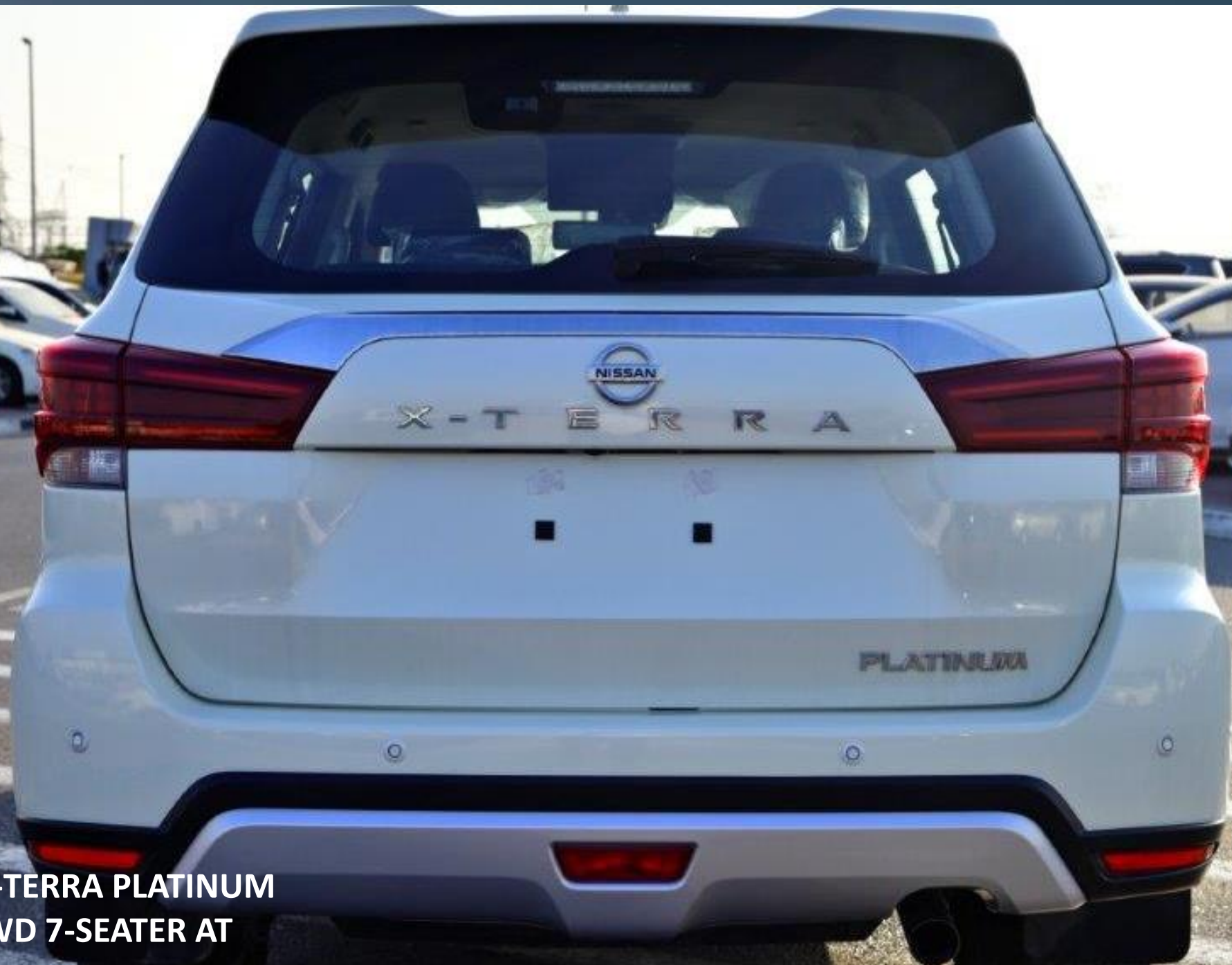
2024 NISSAN X-TERRA PLATINUM 2.5L PETROL 4WD 7-SEATER AT