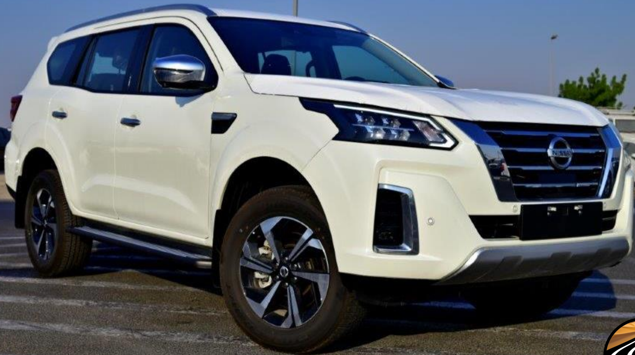
2024 NISSAN X-TERRA PLATINUM 2.5L PETROL 4WD 7-SEATER AT